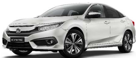
Honda Civic Sedan