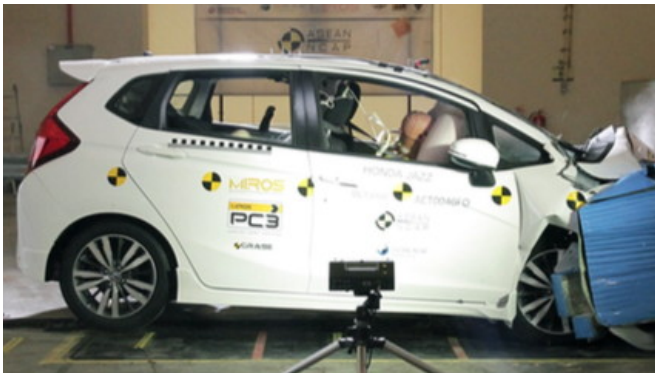
Frontal offset test at 64km/h (ASEAN NCAP)